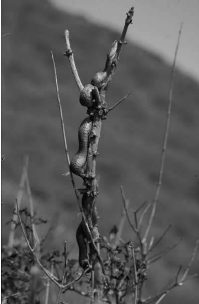
Fig. 1: Shedao pit-viper in ambush posture in a tree

They commenced feeding in the week before we arrived (L. Sun, pers. obs.), so our study spanned most of the main feeding activity for spring 2000.