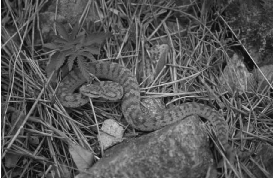
Fig. 2: Shedao pit-viper in a terrestrial ambush site

items. Freshly ingested prey could be distinguished from partially digested birds by palpation. Trials in which we measured dead birds, and then fed them to free-ranging snakes, showed that bolus diameters provide valid indices of prey sizes (maximum error 3 mm from five prey items). We painted a number on each snake's dorsal surface so that the animal could be identified without recapture on subsequent occasions.