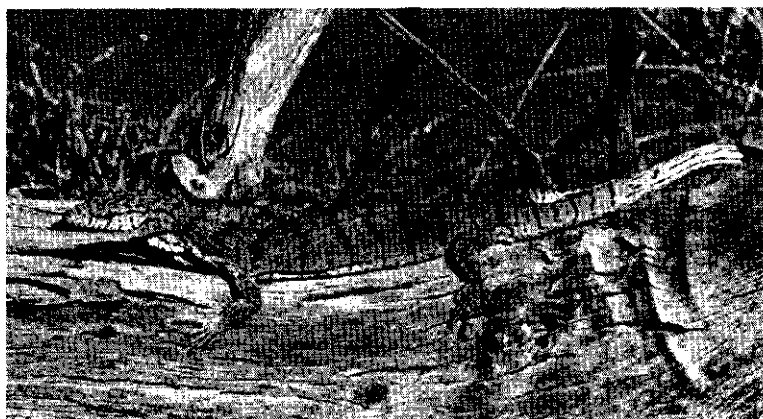
Fig. 2—Adult male Varanus gilleni from 5 miles west of Neale Junction, W.A. The dorsal ground colour is a rich golden brown, with deep maroon coloured irregular cross bars. The patterning of dark-brown lines on top of the head is diagnostic. Tail and sides are predominantly greyish, with dark brown spots laterally, becoming bands dorsally and stripes distally on the tail. Ventrally cream-coloured with some speckling of fine grey spots on the throat.

The stippled areas indicate the suggested limits of distribution. As may be seen from the map caudolineatus is strictly a Western Australian form, whereas gilleni has a more "central" distribution. Their ranges taken together approximate that of Varanus eremius (Pianka, 1968) and more or less coincide with the limits of the Australian deserts. I consider it probable that further collecting will decrease the already narrow gap between the